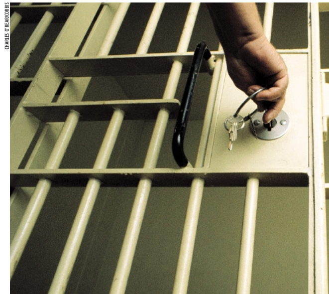
People released from jail account for only a minority of sex offences

The second major flaw in the system relates to the methods used to assess the likelihood that a particular individual will reoffend if released. Here, evaluators rely heavily on actuarial risk assessments. Conceptually, these are similar to the statistical tools used to calculate a person's car insurance premiums given the crime rate in their neighbourhood,